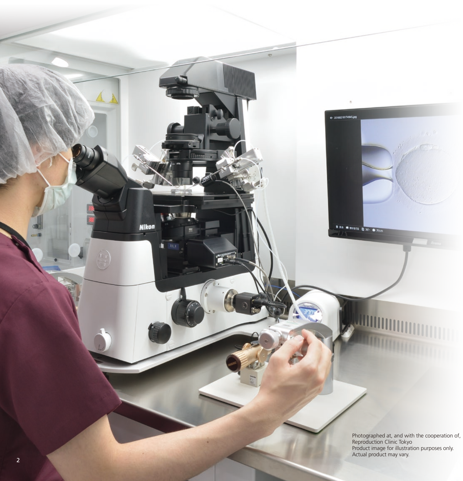
Photographed at, and with the cooperation of, Reproduction Clinic Tokyo Product image for illustration purposes only. Actual product may vary.

The ECLIPSE Ti2-U IVF EU/US provides an ultra-stable platform for performing precision manipulation procedures such as ICSI. The intermediate magnification switching function (1.5X) allows easy switching of observation magnification without changing objectives.