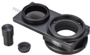
TI2-C-SO Spindle observation system