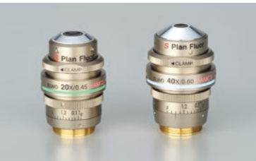
CFI S Plan Fluor ELWD NAMC 20XC (left), CFI S Plan Fluor ELWD NAMC 40XC (right)