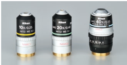
CFI Achromat NAMC 10XF (left), CFI Achromat LWD NAMC 20XF (middle), CFI Achromat LWD NAMC 40XC (right)