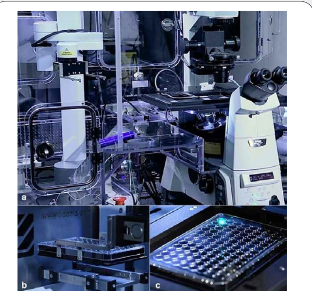
Figure 1 Current robotic microscope design using a Nikon Ti-E inverted microscope. Future system designs utilizing the Nikon Ti2-E can potentially double the throughput of comparable systems. ( a – c ) Nikon Ti-E inverted microscope integrated with a robotic wellplate loader ( a ) for moving samples from incubator ( b ) to microscope stage ( c ). The system displayed in this figure belongs to the Finkbeiner laboratory.

Nikon Instruments Inc., Melville, New York, USA. Correspondence should be addressed to jrallen@nikon.net.